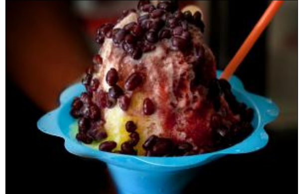
Bikini Beach Cafe's signature Rainbow Shave Ice with Azuki Beans.